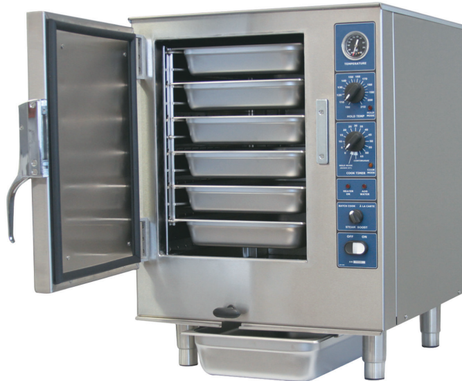
6 - PAN HIGH EFFICIENCY BOILERLESS CONVECTION STEAMER